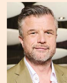
Petroc Trelawny presenter